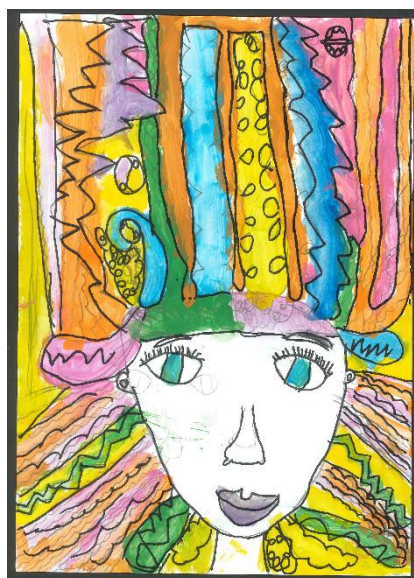
- Annalyia P

Students created crazy hair self-portraits using texture and contrast.