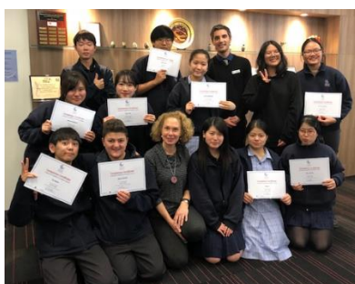
ISEC Graduation – Semester 1 2019